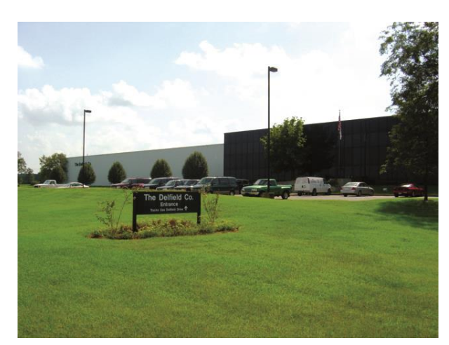
Covington Facility = ~200K Sq. Ft.