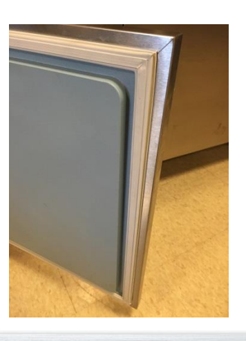
Fluent in Foodservice